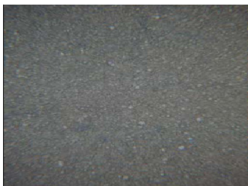
Formulation containing Pribelance™ (3%). (Source: CABB GmbH)

Additional testing has shown that Pribelance™ is leading to slightly finer particle distribution over a range of tested concentrations added to e.g. an O/W cream formulation containing the well known emulsifier system PEG-20 Methyl Glucose Sesquistearate and Methyl Glucose Sesquistearate. Best results are obtained by reducing the content of the emulsifier system to a minimum. All emulsions were homogenized with a High Pressure Homogenizer (1x 100 bar). See also pictures below.