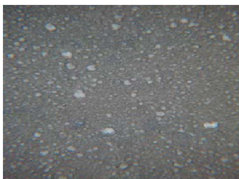
Formulation not containing Pribelance™.

As the forthcoming properties of Pribelance™ as co-emulsifier and co-surfactant are well known, Pribelance™ has been tested in sun cream formulations by an independent research institute.